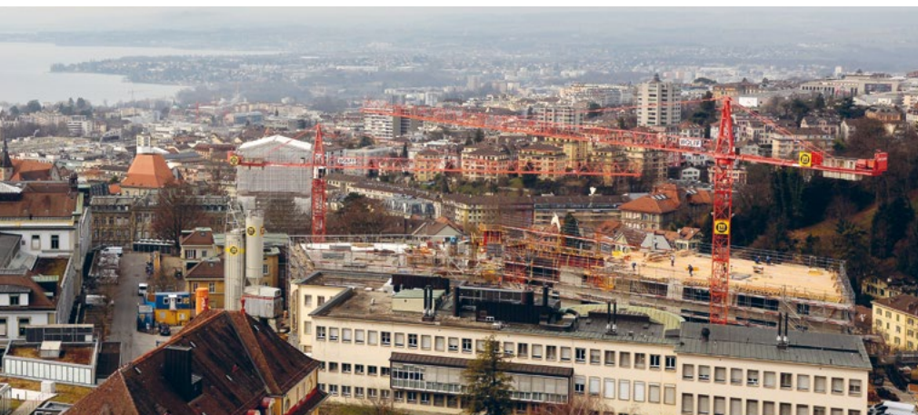
Left AGORA construction site South view

Cancer Center, an auditorium will welcome the best oncology specialists and will serve as a study space where young students can prepare to take over and ensure continuing medical care with a human dimension, in direct interaction with experienced researchers and clinicians.